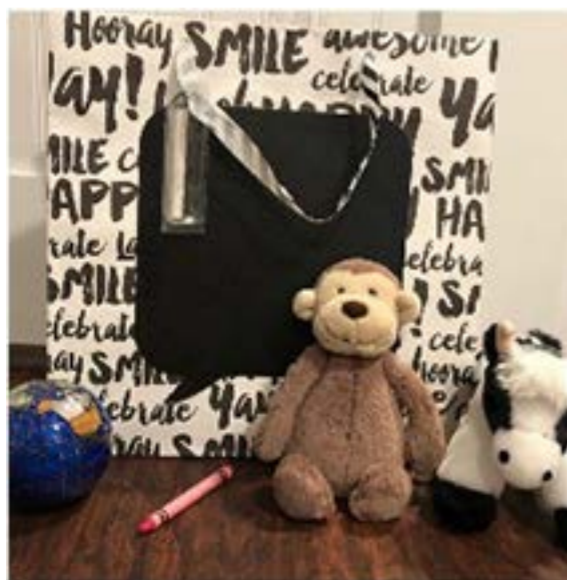
FIGURE 1. A ME BAG AND A FEW OF ITS CONTENTS: TWO FAVORITE ANIMALS, A FAVORITE COLOR, AND A GLOBE TO SHOW WHERE EXTENDED FAMILY LIVES.

Making connections between reading, writing, and talk is an essential component of teaching literacy to elementary students.