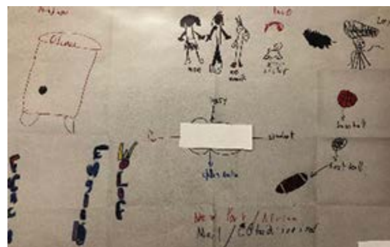
FIGURE 3. A STUDENT'S GRAFFITI BOARD WITH IMAGES AND TEXT THAT ARE REPRESENTATIVE OF HIM.

Graffiti boards can also be used to document students' thinking about books and curricular topics and then facilitate a conversation around the topic. After which, the content included in the graffiti board can be used to develop writing topics or facilitate other lessons.